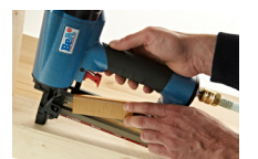
Fast easy loading system